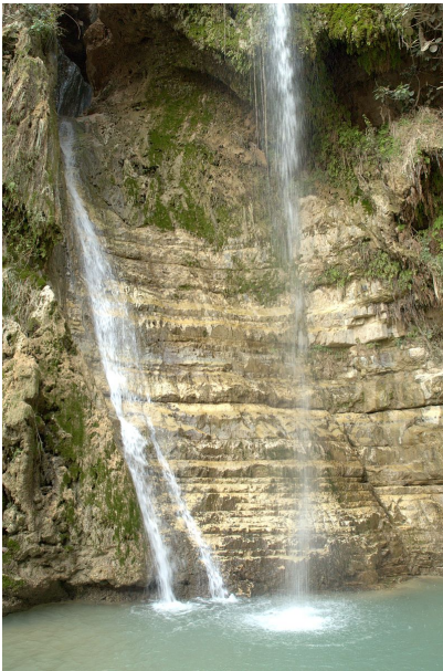
David Falls at En-Gedi

Some writers have entitled this chapter "Self-Restraint" or "Love Your Enemy." This chapter is about opportunity. The saying is opportunity only knocks once. For David we see an opportunity, but we also see a temptation. The opportunity is to take out his pursuer Saul and take his place as king. Remember that David is in the classroom of adversity and God is honing his character to make him more and more a man of God after his own heart. This chapter is one of the biggest "pop tests" David has had up to this point in his life. This begs a question for all of us to ponder - do we sometimes confuse opportune circumstances with the Lord's providential leading?